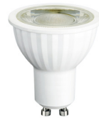
GU10 LED (Sold Separately)